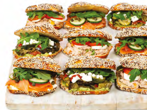
Signature danish sandwiches assortment