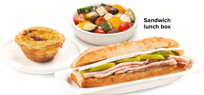
Sandwich lunch box